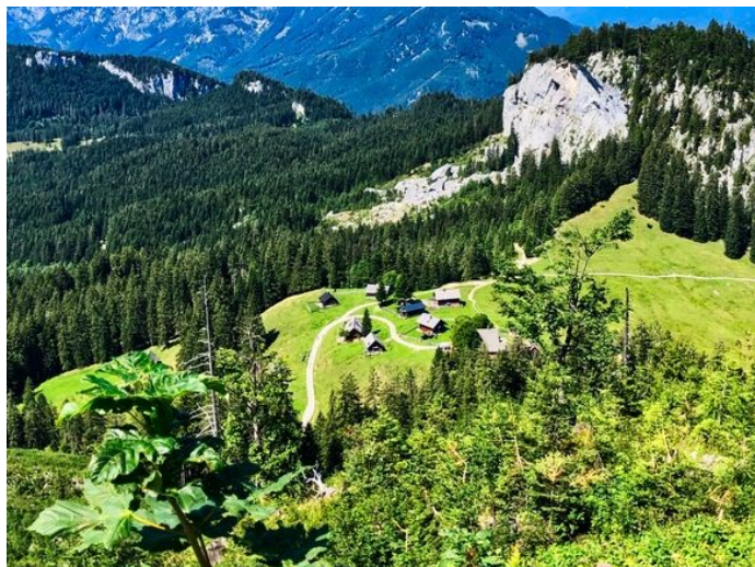
In the Salzkammergut area also E-mountain bikers reach high up!

The Salzkammergut is one of the most beautiful mountain biking regions in Austria. The unique and varying natural landscape with the spectacular views, extensive forests, clear mountain streams and lush meadows give you the necessary energy kick to manage this sporting challenge. Steep climbs are rewarded with magnificent views.