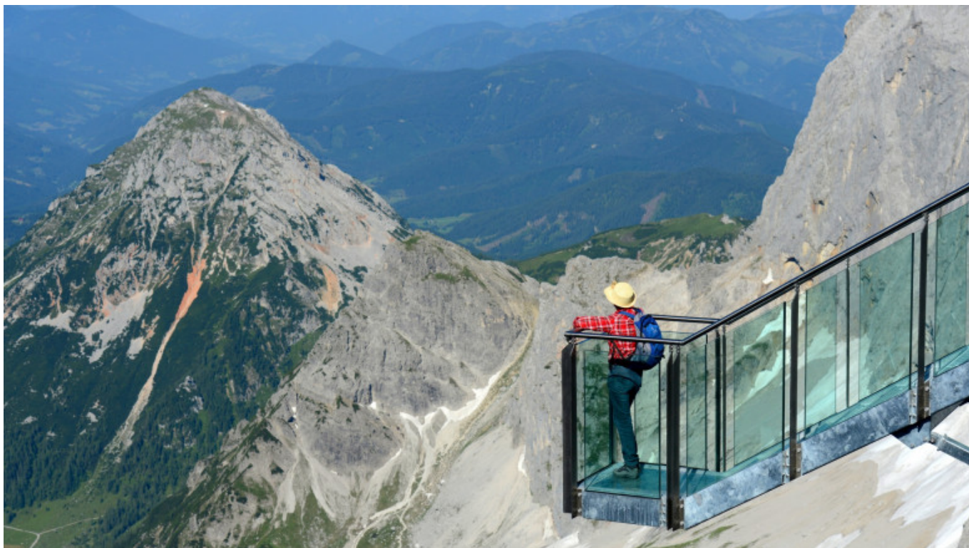
© Der Dachstein - Gery Wolf