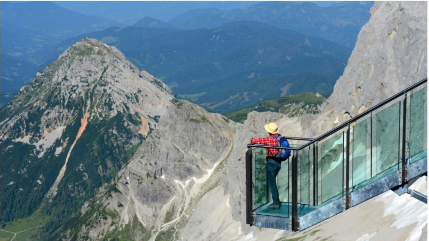
© Der Dachstein - Gery Wolf